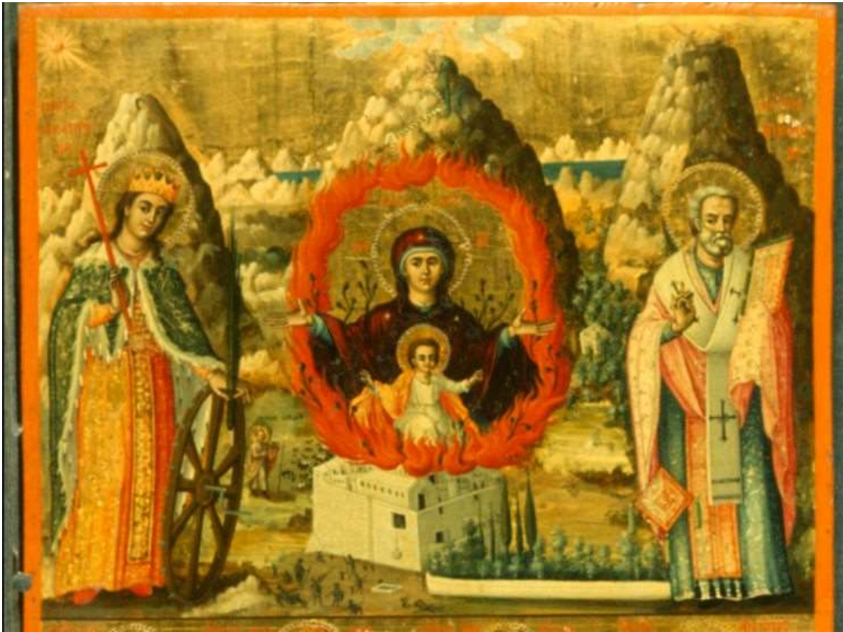
"Virgin of the Burning Bush" over the Monastery of St Catherine

of Christ, and then later the tradition of icons picked this up: the icon of Mary Mother of God as the burning bush hangs at St. Catherine's monastery at Mt. Sinai. Mary--who carried God in her belly and later in her arms yet did not dissolve into ash--she is herself the bush that burns, but is not consumed.