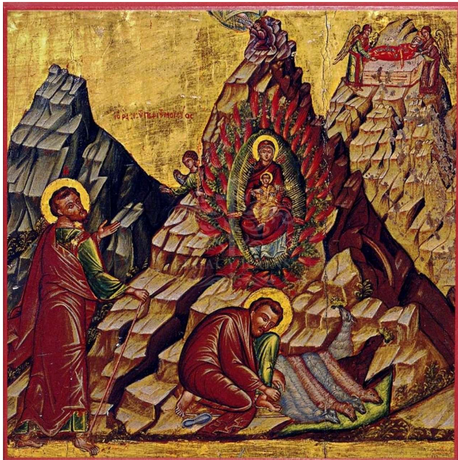
Moses and the Burning Bush (Sinai) Icon, 17th century

The bush that burns with fire but is not consumed--this is perhaps in all of Scripture the most arresting image of God's holiness on earth. From the bush, God speaks: "Take your sandals off your feet, for the place you are standing is holy ground" (3:5). Not only is this a place where God speaks, but it is the place where God comes down: "I have come down to deliver [my people] from the hand of Egypt and to bring them up from that land" (3:8). Here we recognize the essence of the gospel already expressed from the burning bush: God has come down to deliver us and to bring us to a land of promise.